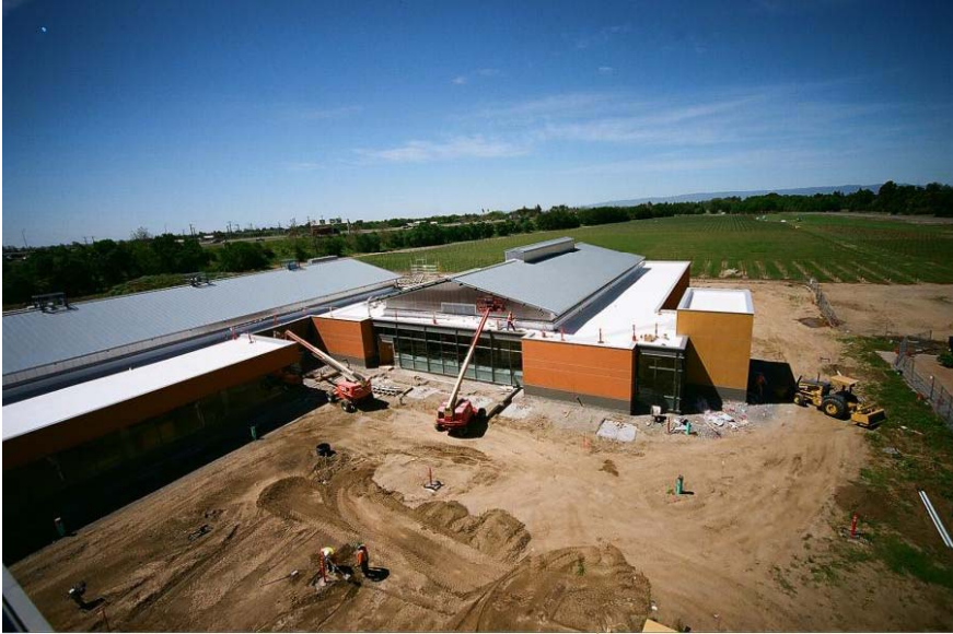
Close to Completion, May 2010