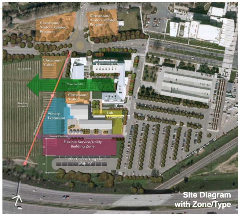
Site Diagram with Zone/Type